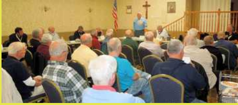
FS reports at Oct meeting.