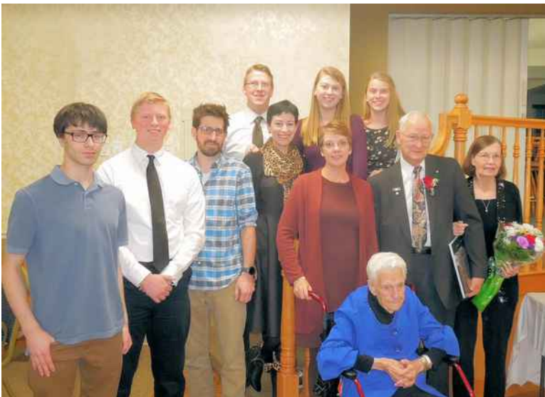
The Richards Clan