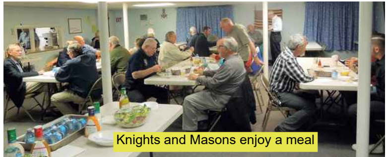
Knights and Masons enjoy a meal