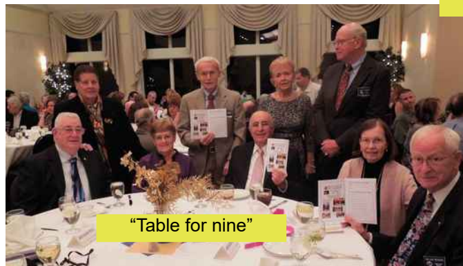
"Table for nine"