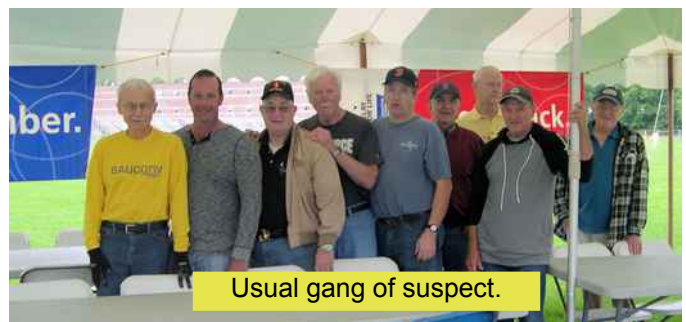
Usual gang of suspect.