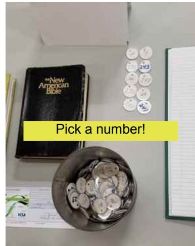
Pick a number!

...and on the 7 th pull, the winner is Wil Boutin!