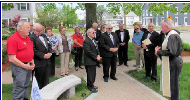
Remembering the brothers.