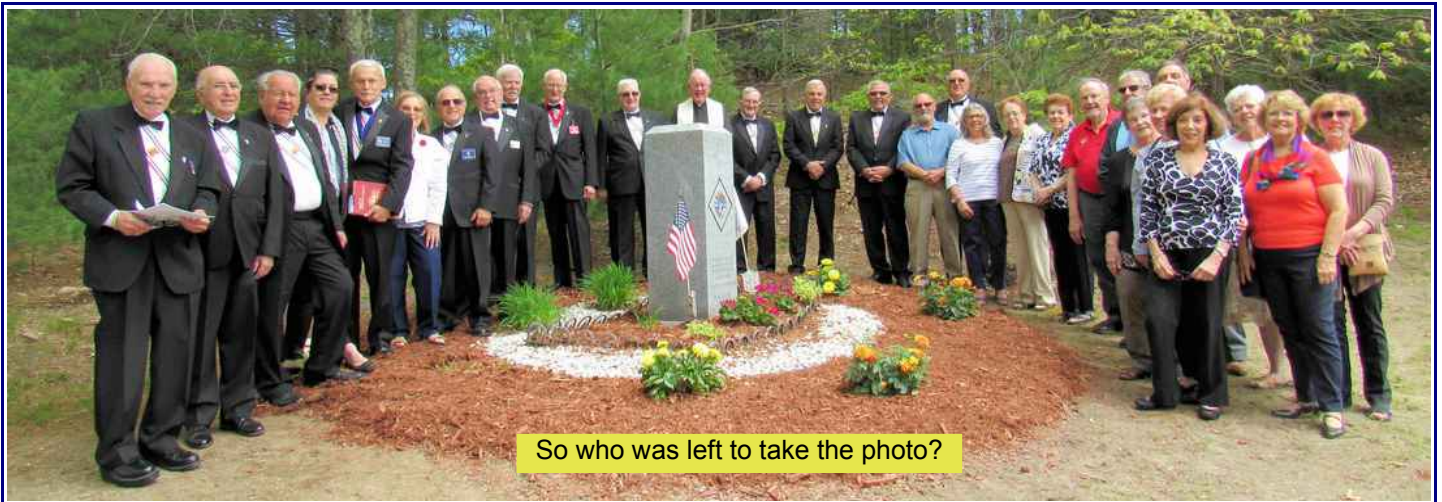
So who was left to take the photo?

for making the arrangements for this annual event. (The 2018 service will be on the Sunday after Mother's day, May 20.)