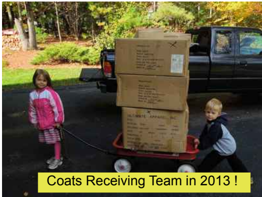
Coats Receiving Team in 2013 !