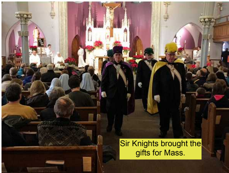
Sir Knights brought the gifts for Mass.