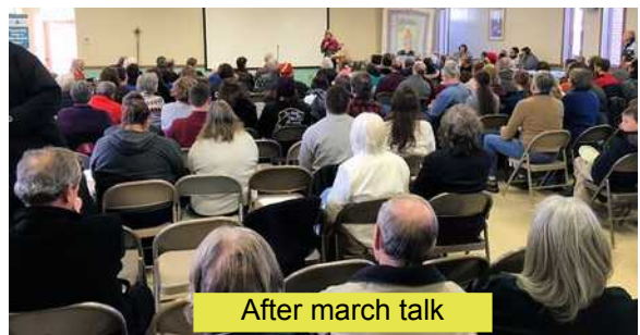
After march talk

Birthright Dinner - February 11 5:00PM Social hour; Dinner at 5:30PM. St. John the Baptist Parish Hall 12 School St, Allenstown, NH