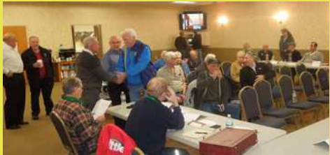
Social time before Jan 11 meeting.