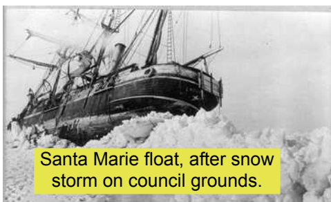
Santa Marie float, after snow storm on council grounds.