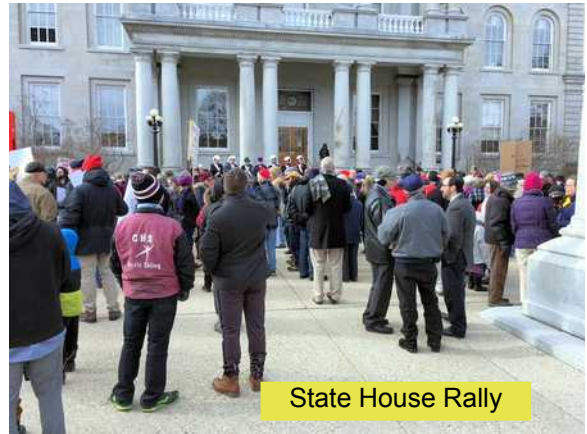
State House Rally