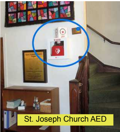
St. Joseph Church AED

Our council donated to our Parish money for two projects. One was to install an AED device at St. Joseph Church. (There is already an AED at Mary, Queen of Peace Church.) It was a good idea to add this life-saving machine to St. Joe Church, especially considering how many old Knights attend Mass there! The AED device is now waiting for your need (and we pray it never has to be used!); it is installed on the rear wall of the church, near the stairs to the choir loft.