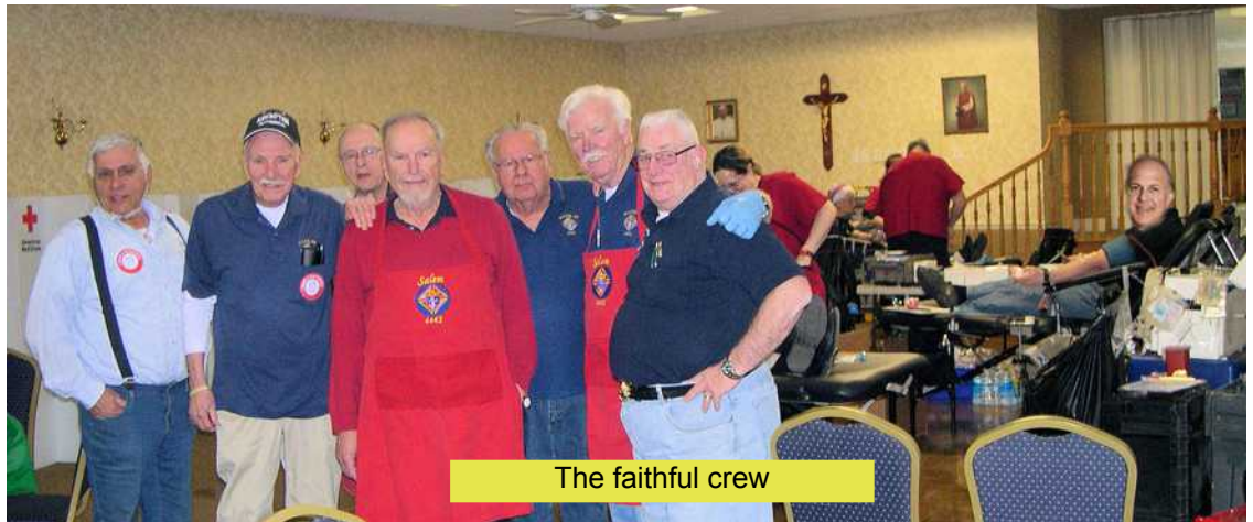
The faithful crew

Each blood drive starts with posting of notices around the town of Salem to announce the date and time of the coming blood drive. KofC members and wives volunteer their time for this great cause. We start early with cooking and hall set-up. The blood drive starts at 1:00PM and closes at 7:00PM, then comes the cleanup of the hall to return it to "normal."