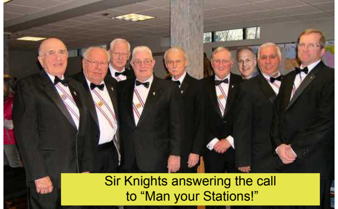
Sir Knights answering the call to "Man your Stations!"